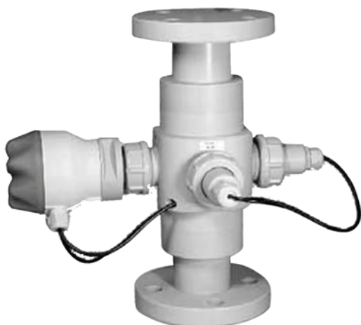
TURBICUBE 20 or TURBICUBE 1000 (PPH measuring cell)

Distilled water: 0 FNU Filtered apple juice: 2...4 FNU River water: 1...4 FNU Milk (fat 3%): around 4000 FNU Filtered Pale ale: 1...6 FNU Raw beer: 20...400 FNU Distilled water, 10% milk: around 20 FNU